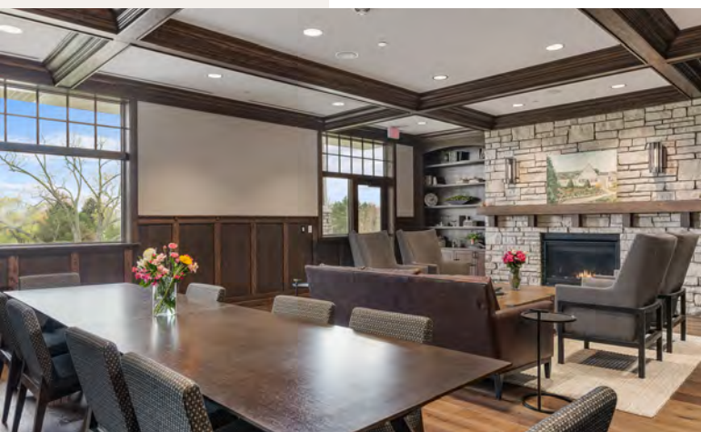
Donald Ross Room