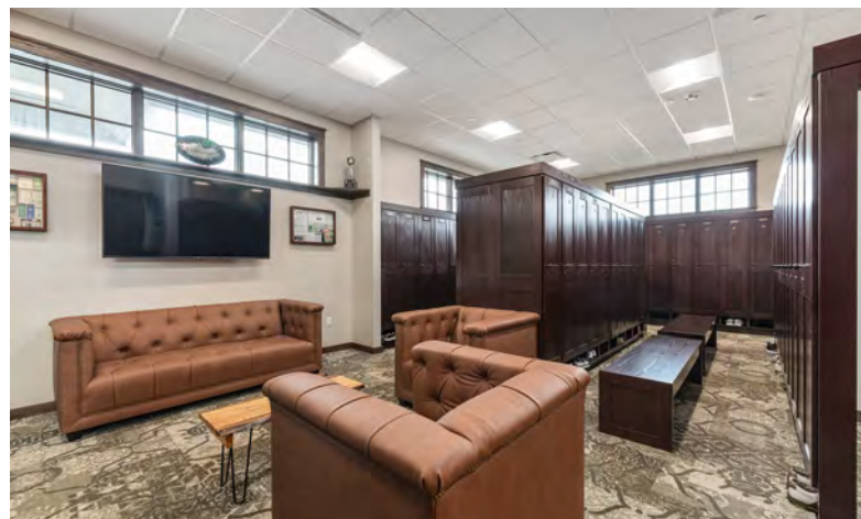
Men's Locker Room