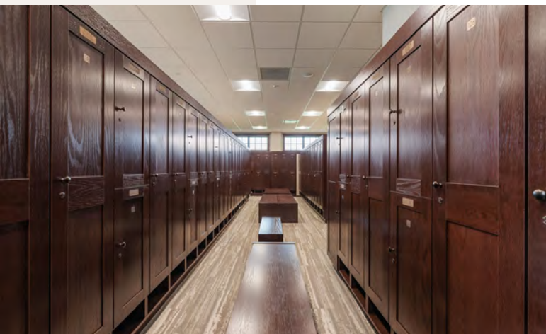
Women's Locker Room